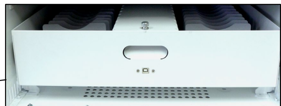
Firmware update port